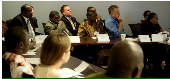
Meeting participants listen intently to the presentations

The USAID-funded NTD Control Program held its grantee meeting August 17-21 in Washington, D.C., bringing together 19 representatives from 10 countries. These groups, as grantees of RTI International, support the Ministries of Health in their countries to establish programs targeting the Neglected Tropical Diseases (NTDs) as part of WHO's strategy for 'preventive chemotherapy' through Mass Drug Administration (MDA). The NTD Control Program is a key part of the United States Government's NTD Initiative to control NTDs through integrated mass drug administration. The week-long conference hosted country program representatives from Burkina Faso, Cameroon, Ghana, Haiti, Mali, Niger, Sierra Leone, Southern Sudan, Togo and Uganda to share the program experience and lessons learned in their efforts to provide national scale treatment for five NTDs, onchocerciasis (river blindness), lymphatic filariasis (elephantiasis),