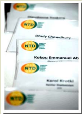
Representatives from 10 countries attended the NTD Grantee Partner Meeting in Washington, D.C

Neglected Tropical Disease Control Program meeting participants share their experience here